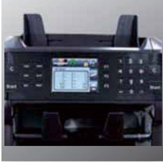
Large size TFT display, graphic based user interface, easy to use.

The state-of-the-art MA NC-7100 is a high-performance currency sorter that is capable of counting and sorting banknotes at a speed of up to 1,000 notes per minute. NC7100 is a new banknote sorter that comes with a capability to improve cash management efficiency by recycling the banknotes in branch and reduce workload with high accuracy and efficient productivity. NC7100 is a compact and cost-effective 2-pocket sorter that is designed and developed to meet with the growing demand for more efficient cash management at branches.