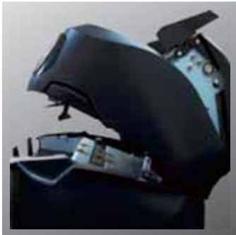
Easy opening billpath design for fast jam removing.