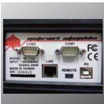
USB and Dual RS232 Interface for PC and thermal printer.