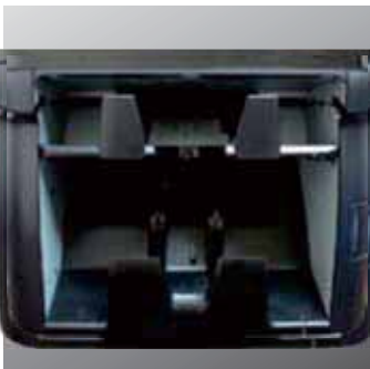
Two pocke for nonstop counting and different sorting purpose.